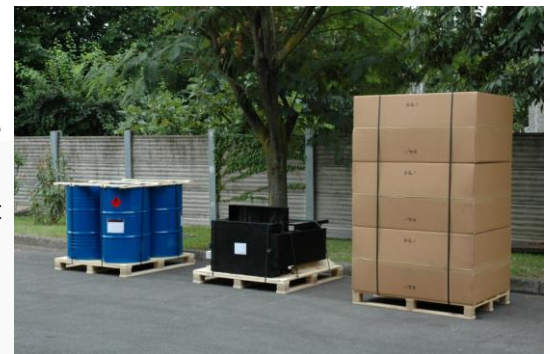
Example of complete supply for gluing the sheets on site